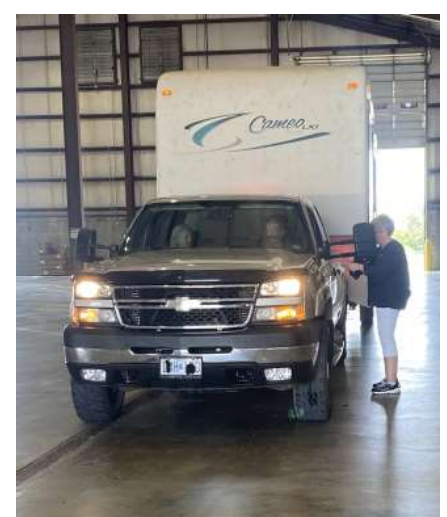
through the warehouse. 1,309 members passed

The 2022 Annual Meeting was held on September 13th, a beautiful day in El Dorado Springs. It started early as members were lined up in their vehicles to register. Sac Osage Electric Cooperative conducted an all-day drive through registration prior to the business meeting at 6:30. This is the third year Sac Osage has had a drive through registration and it has turned into a bit of a car show as members took the opportunity to parade