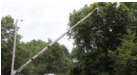
Contractors clear line to maintain reliability.