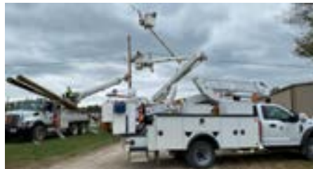
Sac Osage crews upgrading the electric system.