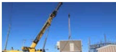
Fiber huts like this one are a new edition to Sac Osage.