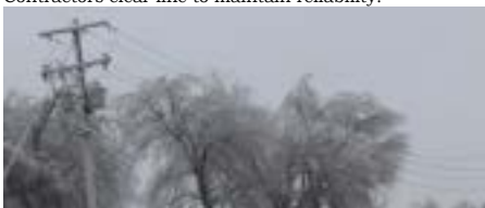
Weather, whether freezing or hot can have a big impact on revenue and expenses.