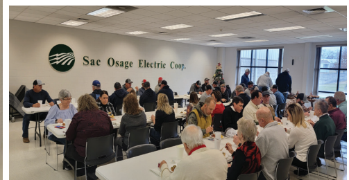
Sac Osage Employees celebrated Christmas by having their annual lunch with the Board of Directors on December 15, 2022.