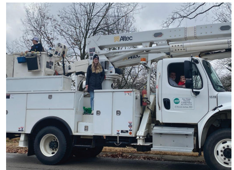
Sac Osage Electric participated in the El Dorado Springs Christmas Parade on December 10, 2022