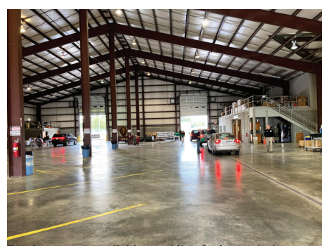
Two lanes were available providing for low wait times.