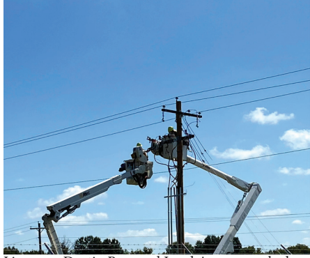
Linemen, Dustin Bray and Jared Asmus, worked high in buckets to complete the cut-over from the mobile sub to the new Taberville substation.