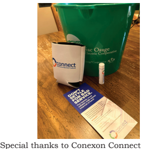
for sponsoring part of the door prize at the Annual Meeting.. Learn more at ConexonConnect.com/SacOsage