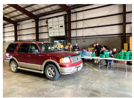
Members could register without leaving their car.