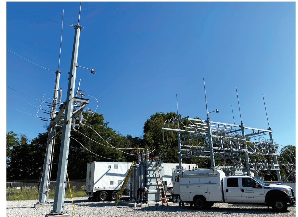
KAMO construction crews make final connections to new Taberville substation.

struction has proceeded in phases. For a brief period, KAMO brought in a mobile substation. For each of these phases, members had to endure various outages, so the construction could proceed safely. Sac Osage appreciates the patience the patience the members have shown.