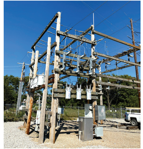
The old Taberville substation was a wooden structure designed to be temporary. It served the cooperative for many years.