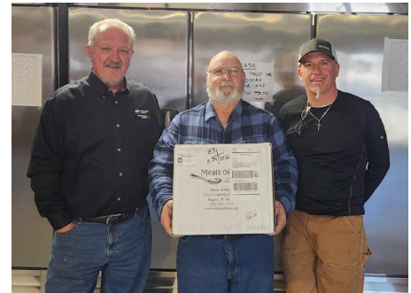
Meals of Hope Box delivered to the Hope Center in El Dorado Springs

To join this meaningful cause, prospective participants can sign up for the program by contacting Sac Osage Electric at 417-876-2721 or by filling out an online form available at sacosage.com/operation-round .