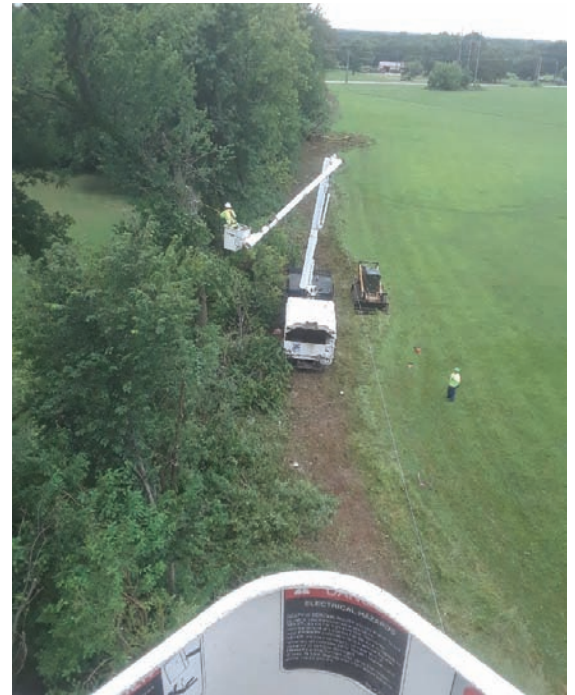
Right of way contractors work high in the sky to clear overhead line of branches in the Iconium area.