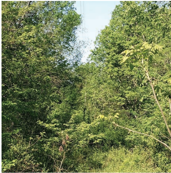
Can you spot the power line through the trees?